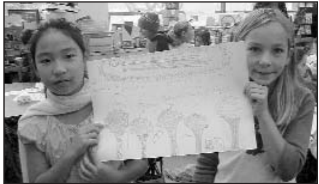
Students at Le Conte Elementary School created original posters that teach about the benefits of recycling.