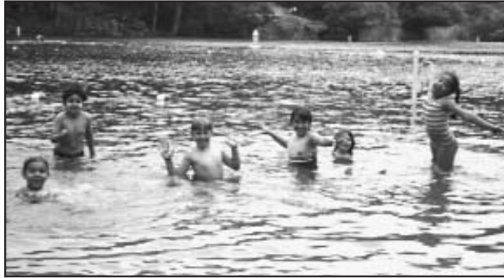
Children enjoy the refreshing waters of Lake Anza during the KIDS for the BAY Summer Camp

In this week long Aquatic Science Adventure Camp students take a boat trip on the San Francisco Bay and study the animals and plants living in the open water. They complete more detailed investigations of bay-estuary and creek habitats, including water quality testing and they learn how to