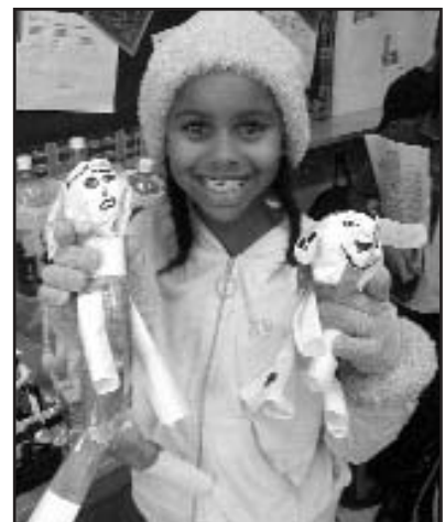
A student from Malcolm X Elementary School in Berkeley proudly displays her reuse art project pieces.