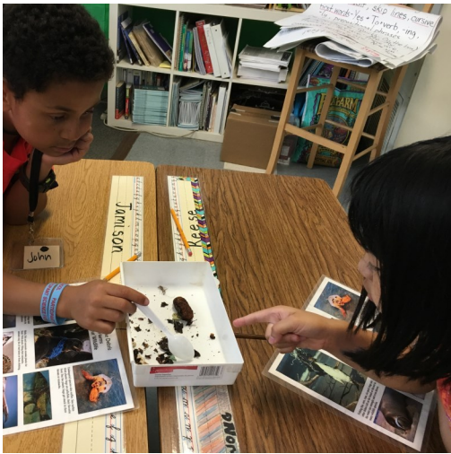
Bay Farm fourth graders dissecting an Albatross Bolus and separating natural items the bird digested from plastic debris.