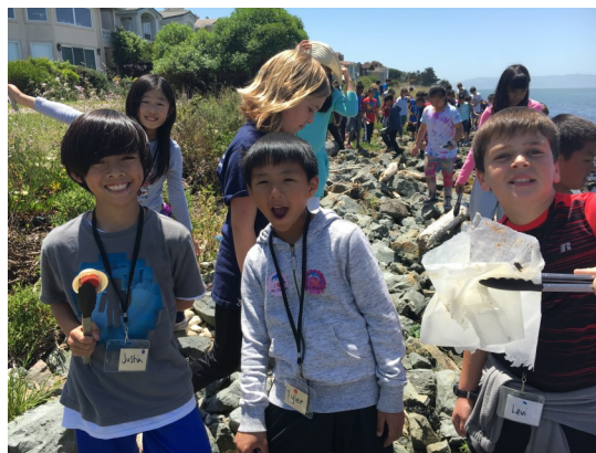
Bay Farm fourth grade students picking up trash at the bay shoreline.

City of Alameda Public Works Department Public Works Works for You!