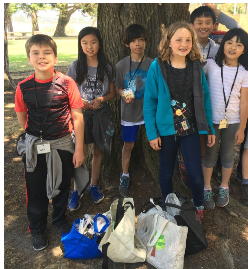
Edison third grade proudly standing by the trash they picked up from their shoreline clean-up Action Project.