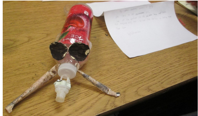
A shrimp made by a third grader from Henry Haight Elementary and a story about the creature.