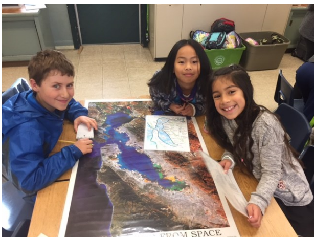
Edison third graders investigating San Francisco Bay geography.