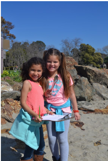
Ruby Bridges third graders picking up trash at Crab Cove in Alameda.