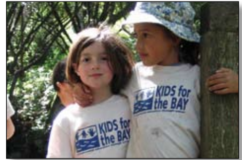
Make new friends at summer camp!