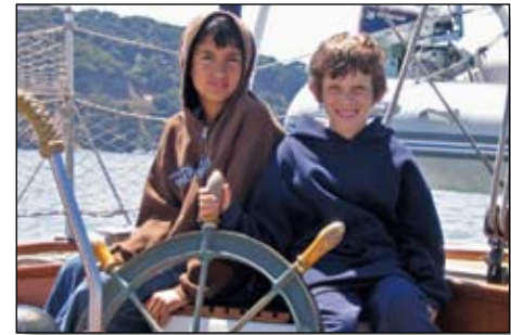
Sail on the San Francisco Bay!