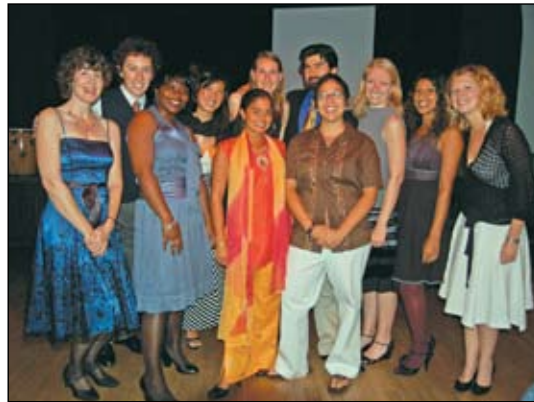
KftB staff celebrates 15 Years of Excellence!