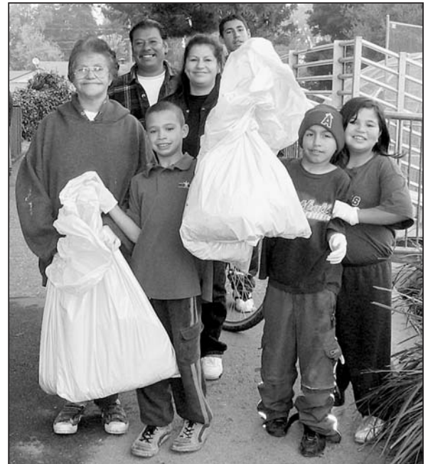
Students and family members all pitched in to help clean up Wildcat Creek.

"Students are always sad to learn that marine animals can be injured and even killed by floating debris," explained