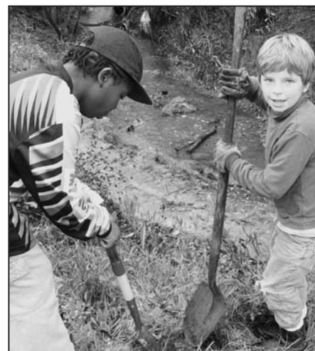
Students plant natives at Codornices Creek to help prevent erosion and improve the creek as a habitat for Steelhead Trout.

Steelhead begin their lives in freshwater creeks. In our area, this means