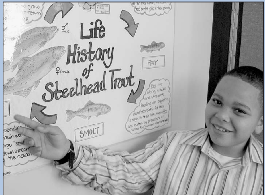
A student explains the fascinating lifecycle of a Steelhead Trout.

In January, two classes from Berkeley Arts Magnet Elementary